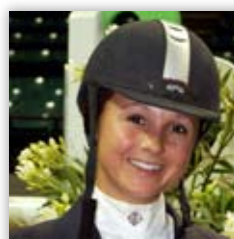
Phelps Media Group

Born: January 20, 1983 Residence: North Salem, New York