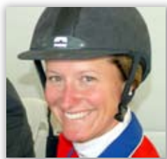
Phelps Media Group

Born: August 11, 1970 Residence: Wellington, Florida