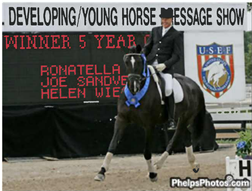
Electronic scoreboard in use at the USEF Young & Developing Horse Dressage Championships in Lexington, KY this September. Scoreboard services provided by The Scoreboard Guys, LLC.